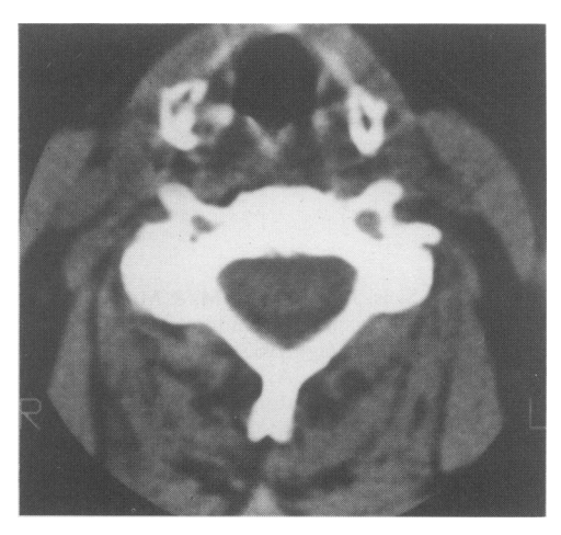
Figure 2 Three weeks later, unenhanced CT scan at C5 level reveals complete resolution of haematoma.

Myelography typically demonstrates complete or partial spinal block.<sup>4</sup> Unenhanced high resolution CT scan usually shows a biconvex dense mass, obliterating extradural fat and abutting against the inner border of the bony canal dorsally or dorsolaterally.<sup>5</sup>